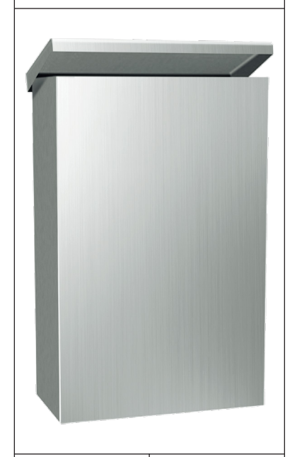
Scan for Information