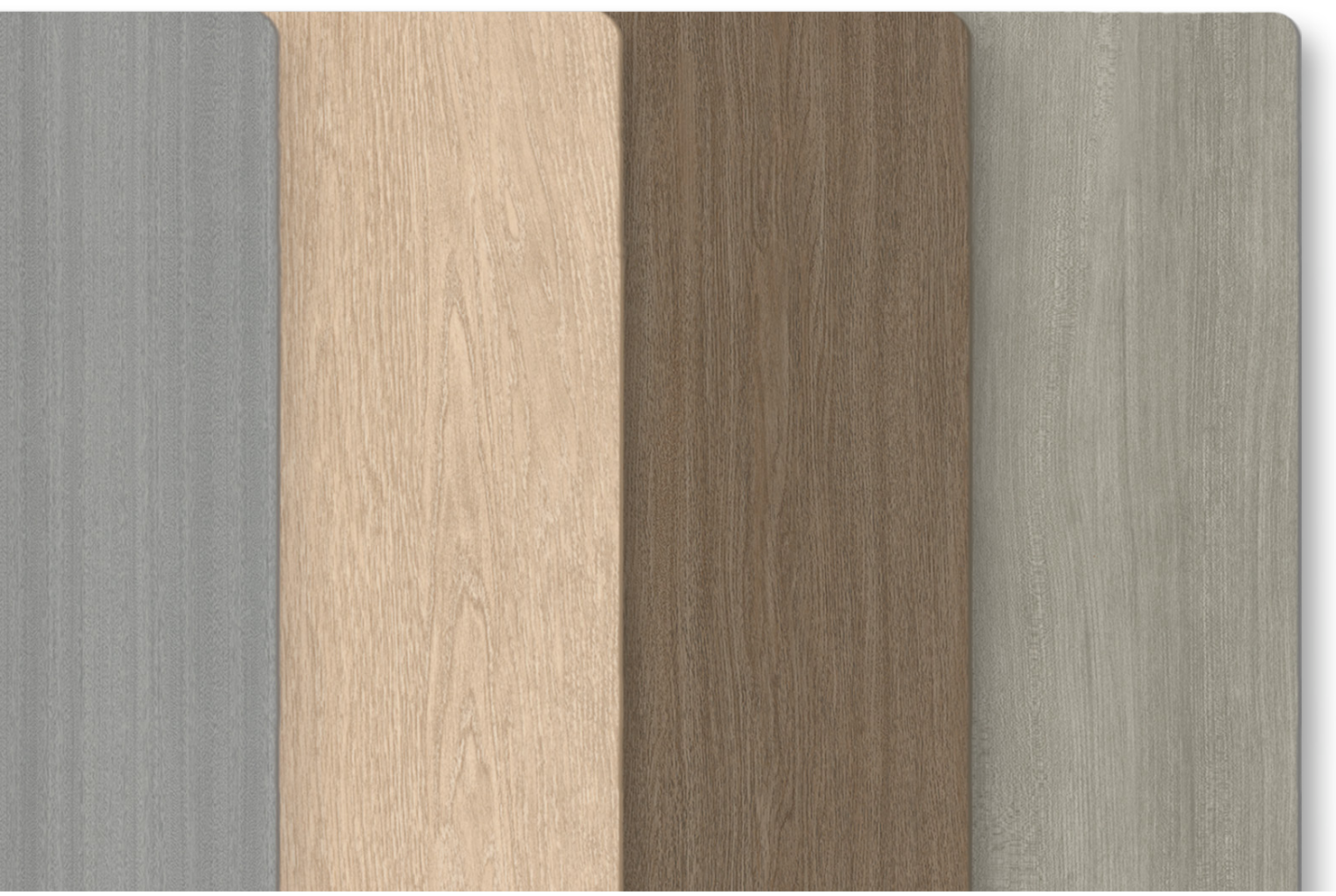
From left: Cool Gray Ribbonwood, Snowed New Oak, Weathered Willow Oak, Shadow Papyrus

Discover a new, modern update to our Acrovyn® Woodgrains Collection. Explore an updated palette of authentic wood designs in a range of wood tones that is more realistic than ever before. Some of our New Acrovyn Woodgrains can even be enhanced with a complementary texture and embossed to create the most authentic wood appearance in wall protection.